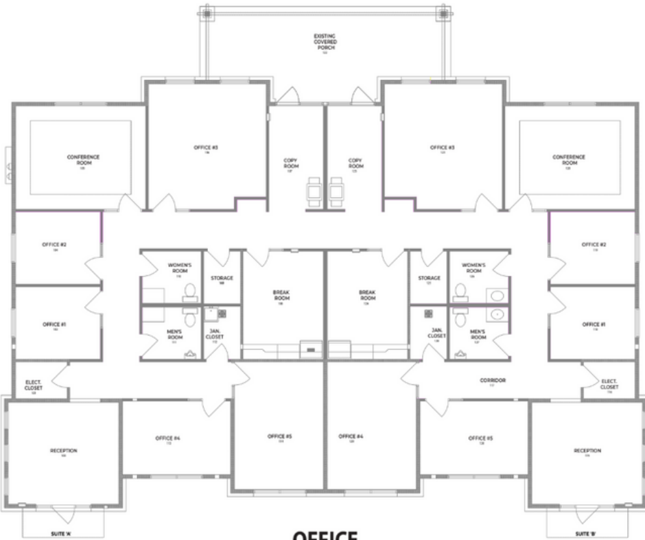
OFFICE FLOOR PLAN