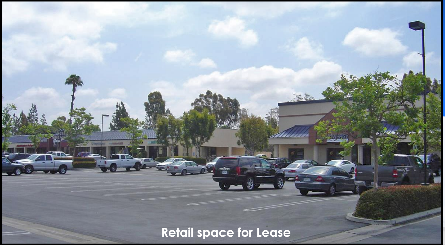
Retail space for Lease