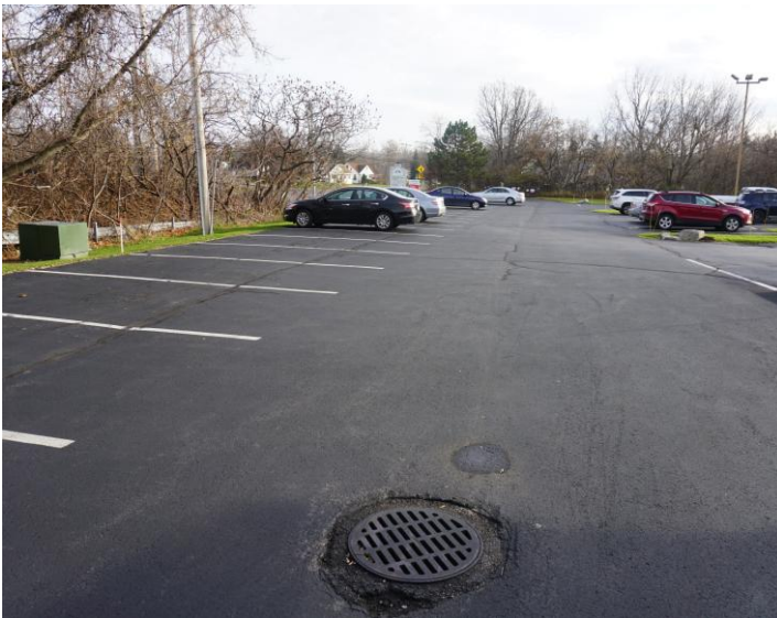
Plenty of parking