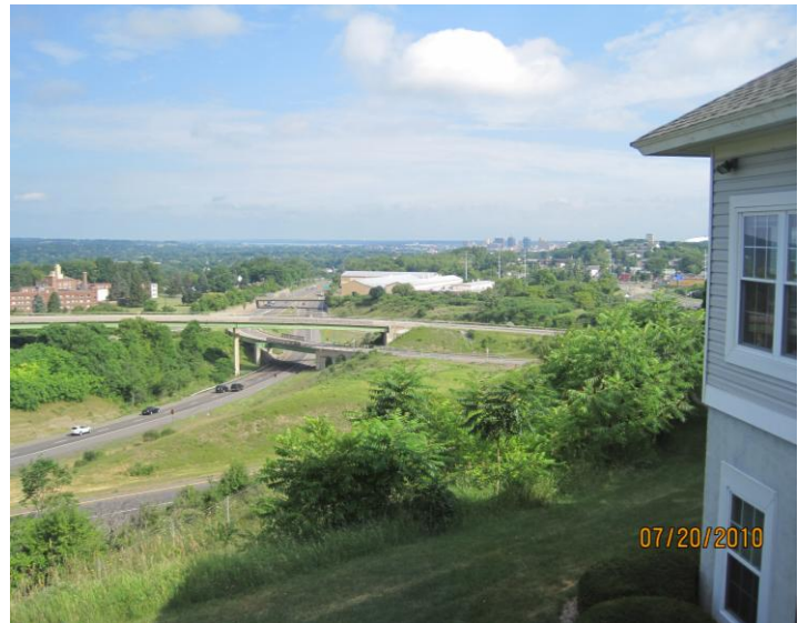
Immediate access too area interstates