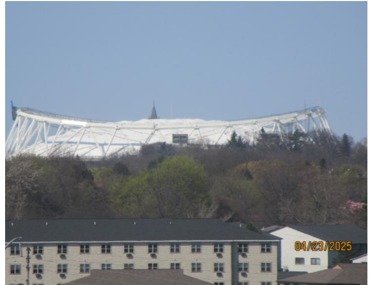
Close to Syracuse University