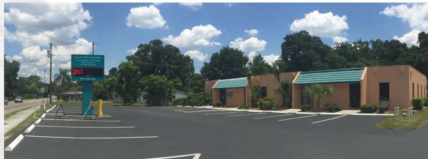
Digital street pylon sign available for your advertising

NO WARRANTY OR REPRESENTATION, EXPRESSED OR IMPLIED, IS MADE AS TO THE ACCURACY OF THE INFORMATION CONTAINED HEREIN, AND SAME IS SUBMITTED SUBJECT TO ERRORS, OMISSIONS, CHANGE OF PRICE, RENTAL OR OTHER CONDITIONS, WITHDRAWAL WITHOUT NOTICE, AND TO ANY SPECIFIC LISTING CONDITIONS, IMPOSED BY OUR PRINCIPALS.