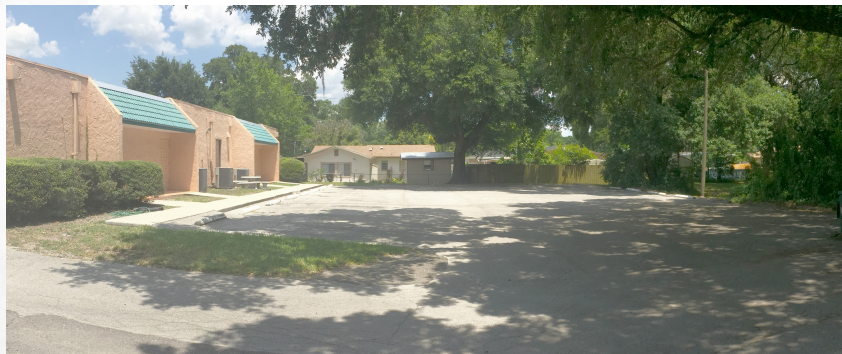
Employee parking in rear of building