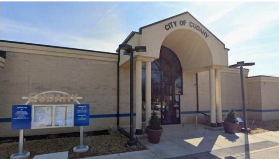
CUDAHY CITY HALL

As part of the greater Los Angeles metropolitan area, Cudahy is surrounded by a diverse mix of residential neighborhoods, commercial corridors, and industrial employment hubs.