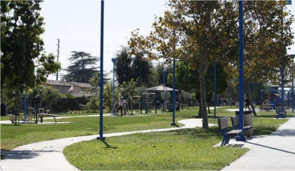
CLARA STREET PARK

Cudahy is a centrally located city in Southeast Los Angeles County with a population of approximately 23,000 residents. Known for its tight-knit community and strong workforce presence, the city plays an important role within the broader Gateway Cities region, one of the most densely populated urban areas in Southern California.