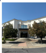
2075 OVERLAND OFFICE 10,000 SF OFFICE BUILDING