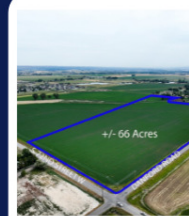
6807 DANFORD LAND +/- 66 Acres 66 ACRE LAND DEVELOPMENT