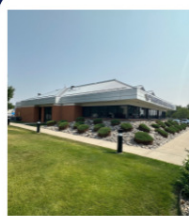
2675 KING AVE W RETAIL FORMER BANK