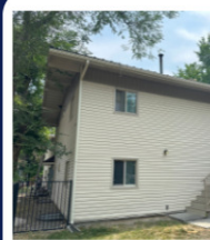
707 N 31ST MULTI-FAMILY 12-PLEX