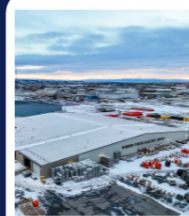
206 PLAINVIEW INDUSTRIAL 80,000 SF WAREHOUSE