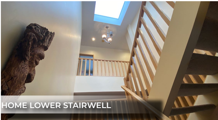
HOME LOWER STAIRWELL