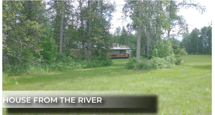
HOUSE FROM THE RIVER