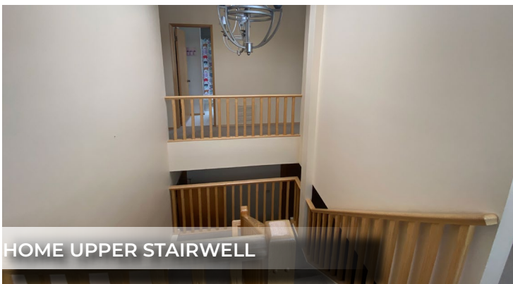
HOME UPPER STAIRWELL