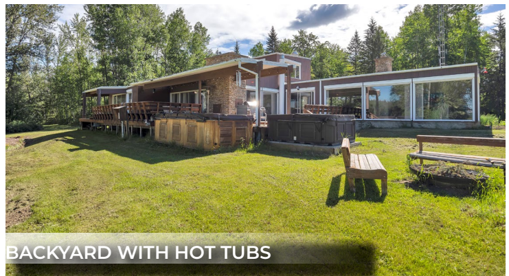
BACKYARD WITH HOT TUBS