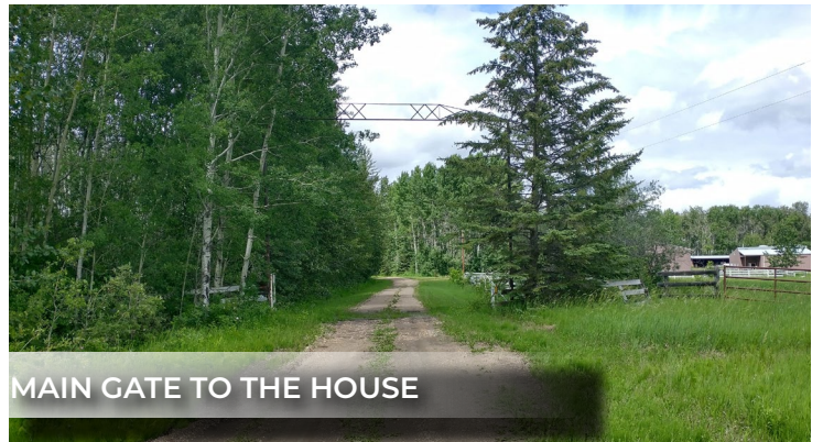
MAIN GATE TO THE HOUSE