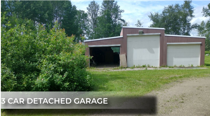
3 CAR DETACHED GARAGE