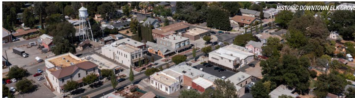
HISTORIC DOWNTOWN ELK GROVE