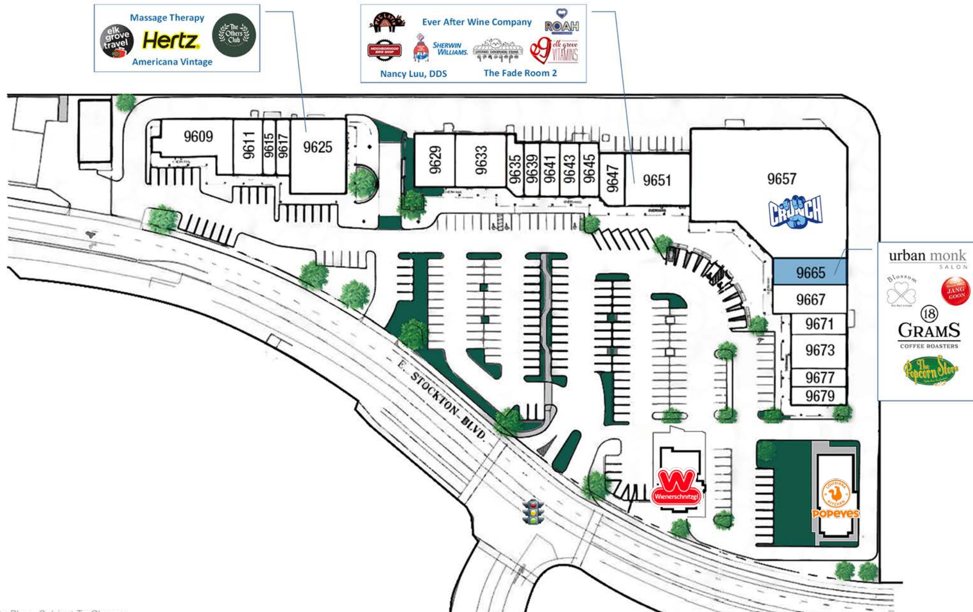
Site Plan - Subject To Change

9605-9675 E. STOCKTON BLVD. IN ELK GROVE, CA