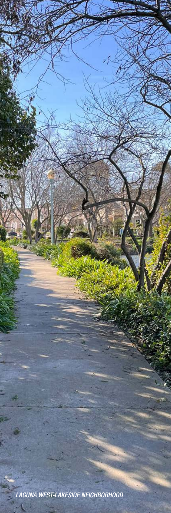
LAGUNA WEST-LAKESIDE NEIGHBORHOOD