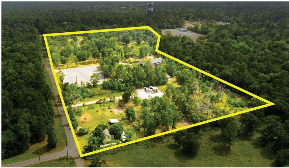
Located 14 miles from The Woodlands, TX and 40 miles from Houston, TX in the Rapidly Growing Area of Magnolia, TX.