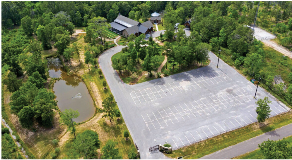
Situated on 15 Pristine Acres in Magnolia, Texas. Breathtaking Expansive Views, Versatile Layout, 100+ Parking Available