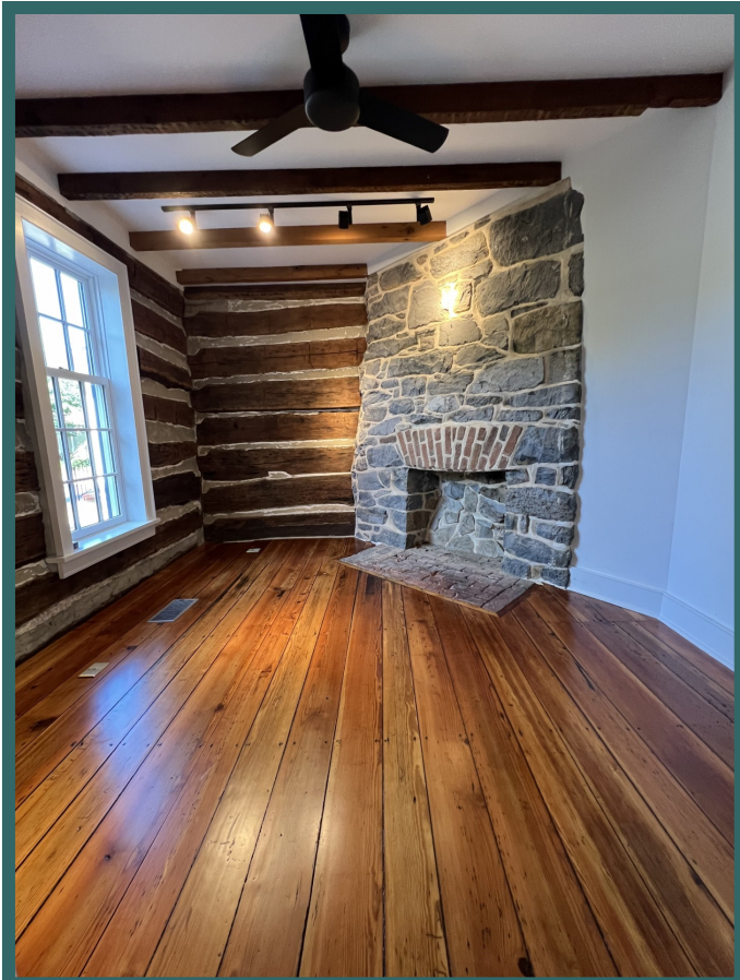
Downstairs Rear Office