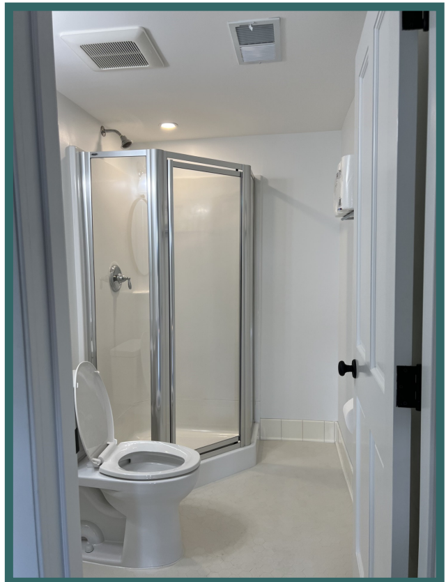
Second Floor Bathroom With Shower