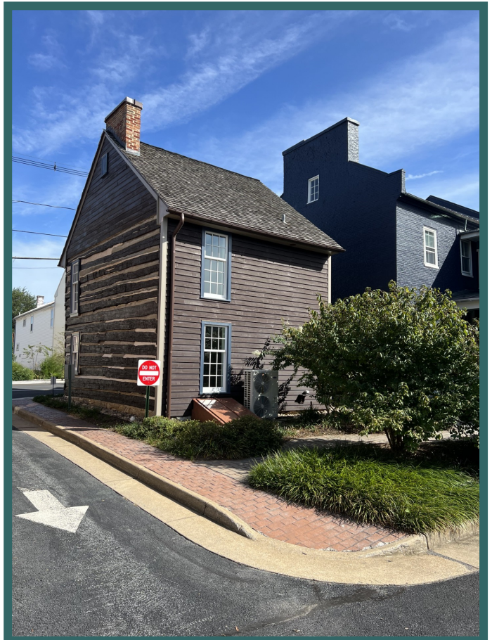
Rear View From Parking Lot