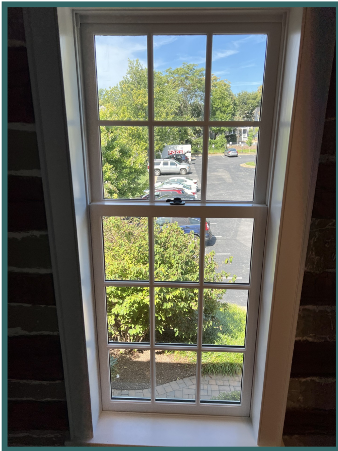
View to Parking Lot