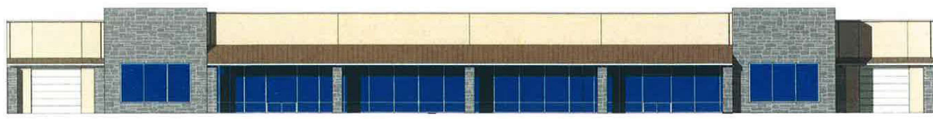
② Front View 1" = 20'-0"