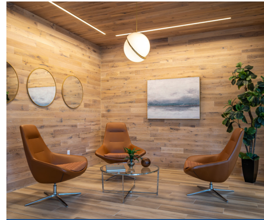
Executive Suite Foyer