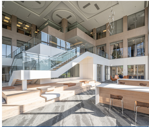
1st Floor Lobby