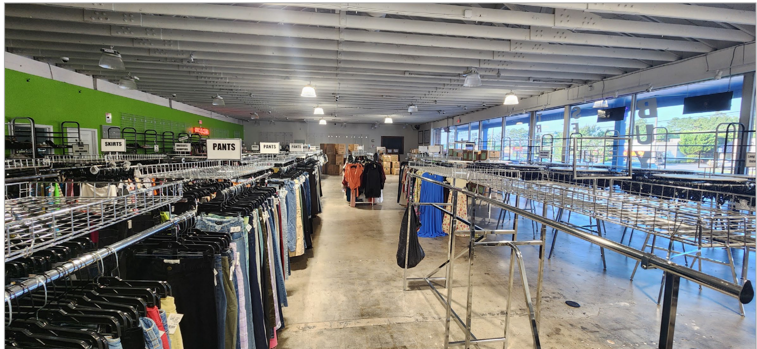
Interior View- Rear to Front