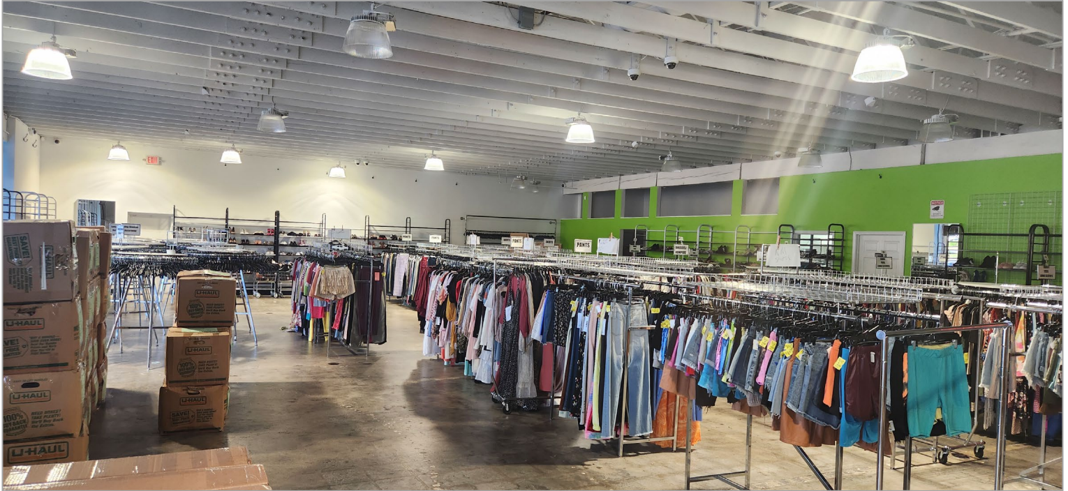
Interior View- Front to Rear