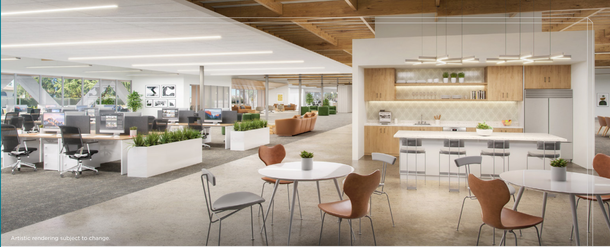
Artistic rendering subject to change.