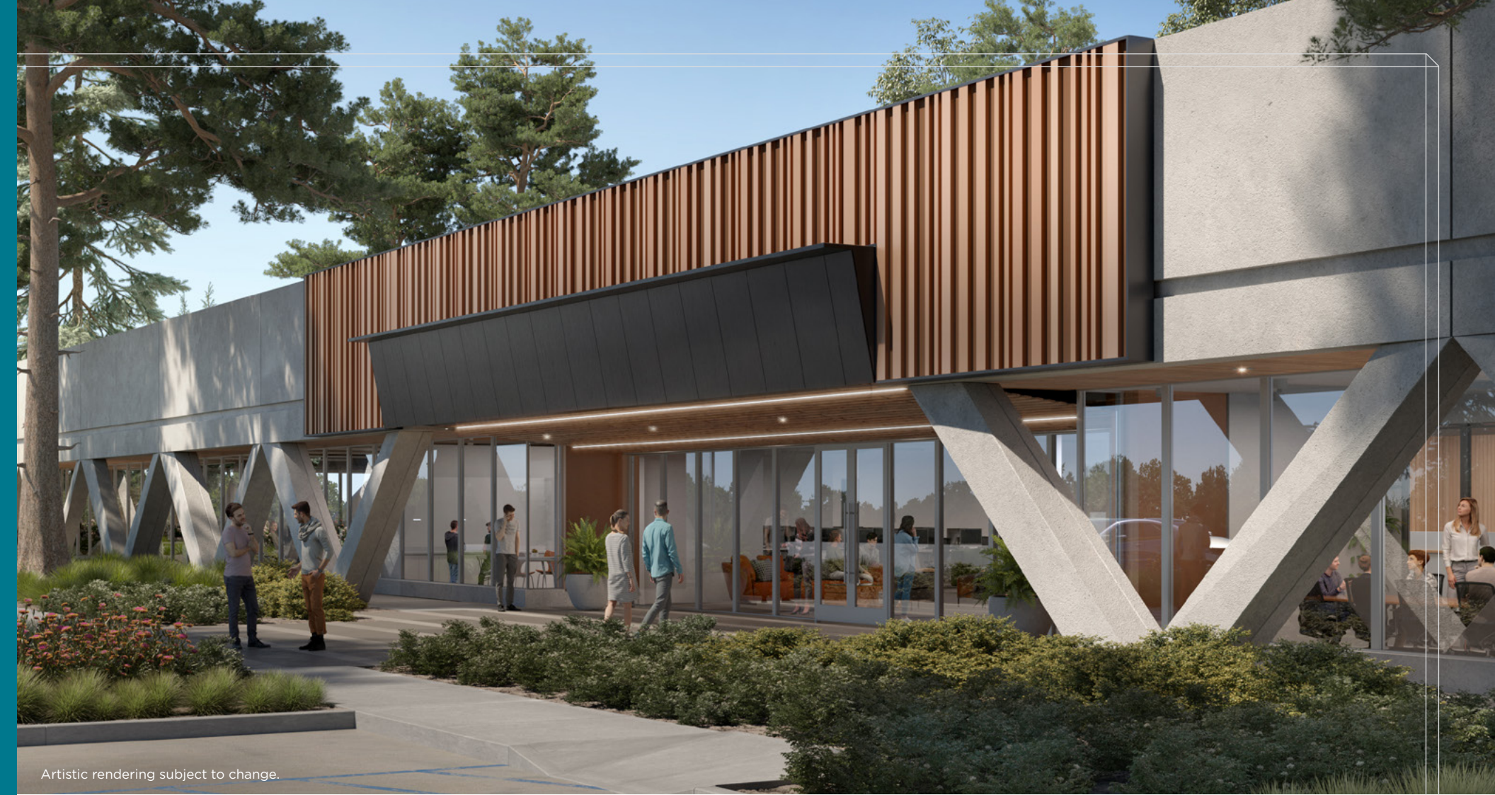
Artistic rendering subject to change.