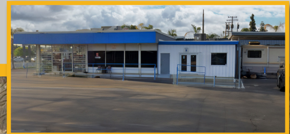
911 Oak Street