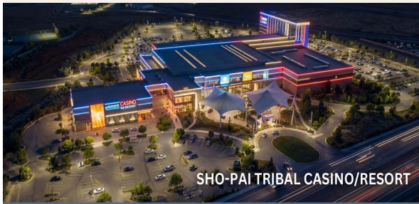
SHO-PAI TRIBAL CASINO/RESORT

Most interchanges have one demand source. Exit 74 has three, all maturing at the same time. A regional casino destination, a master-planned residential build-out adding thousands of rooftops, and a semiconductor workforce expansion at Idaho's largest private employer — converging on the same Simco Road interchange.