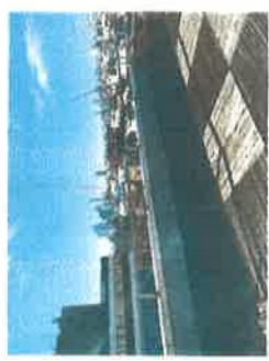
3256 STEINWAY REAR NYC CITY VIEWS