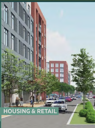
HOUSING & RETAIL