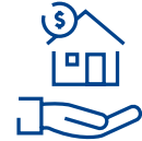
Average Household Income 2023