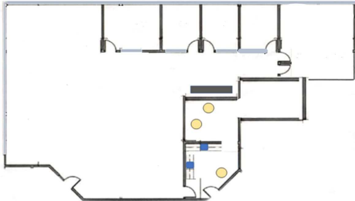
SUITE 1 - 4,663 SF