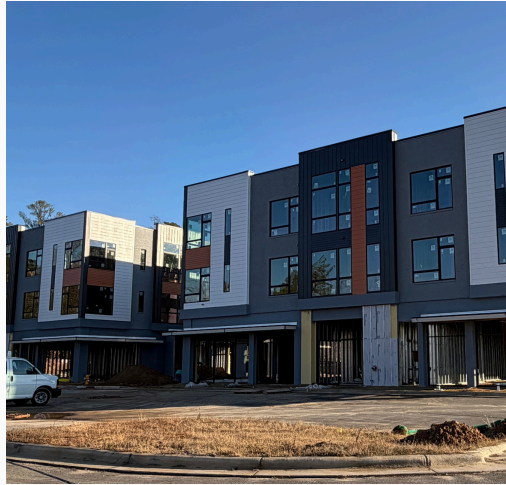
Prime Retail Space