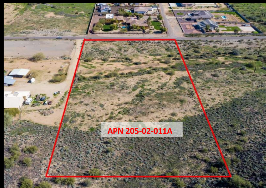
Oblique view easterly across Parcel 011A