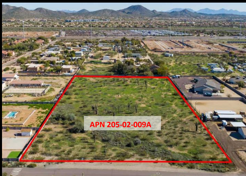
Oblique view easterly across Parcel 009A