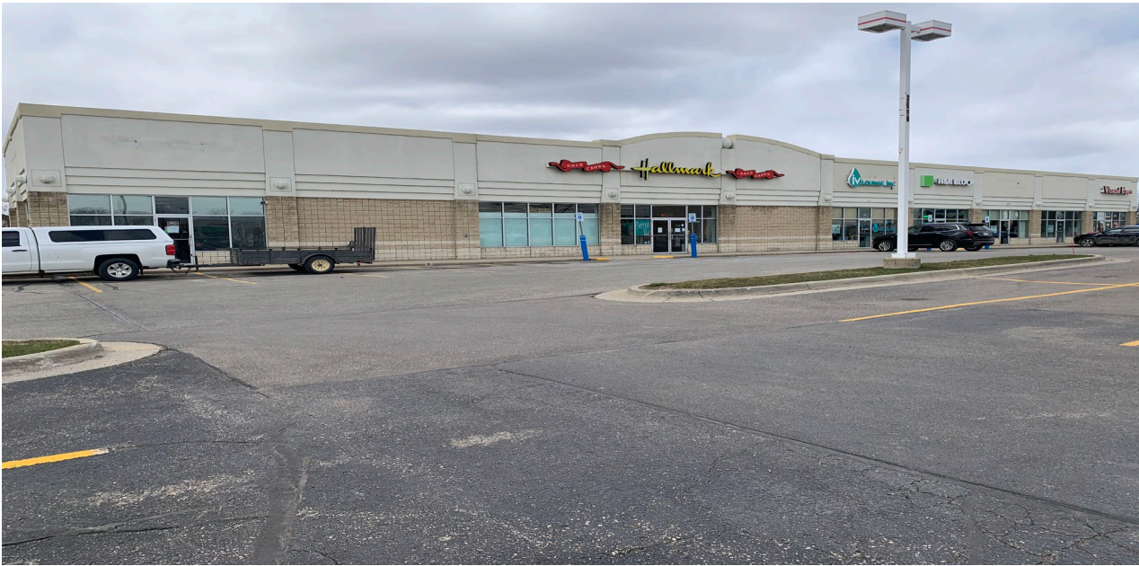
604 & 602 S. Main Street