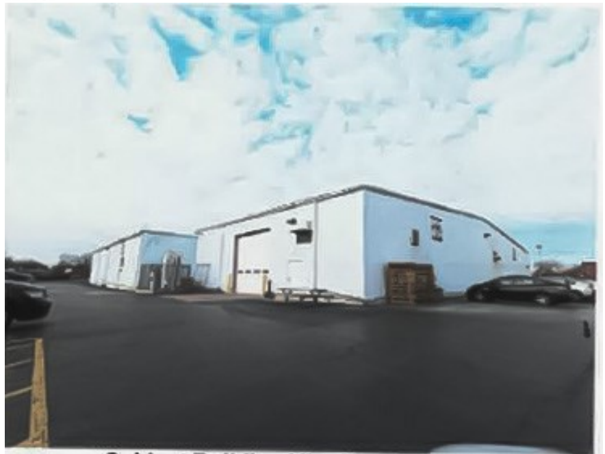
Subject Building Viewing Northwest