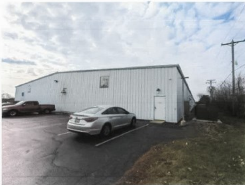
Subject Building Viewing Southwest