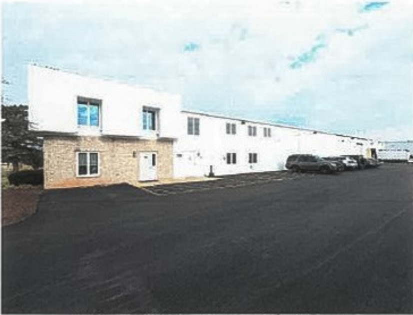
Subject Building Viewing Northeast