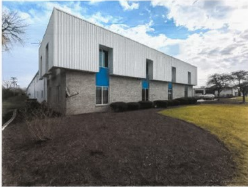
Subject Building Viewing Southeast