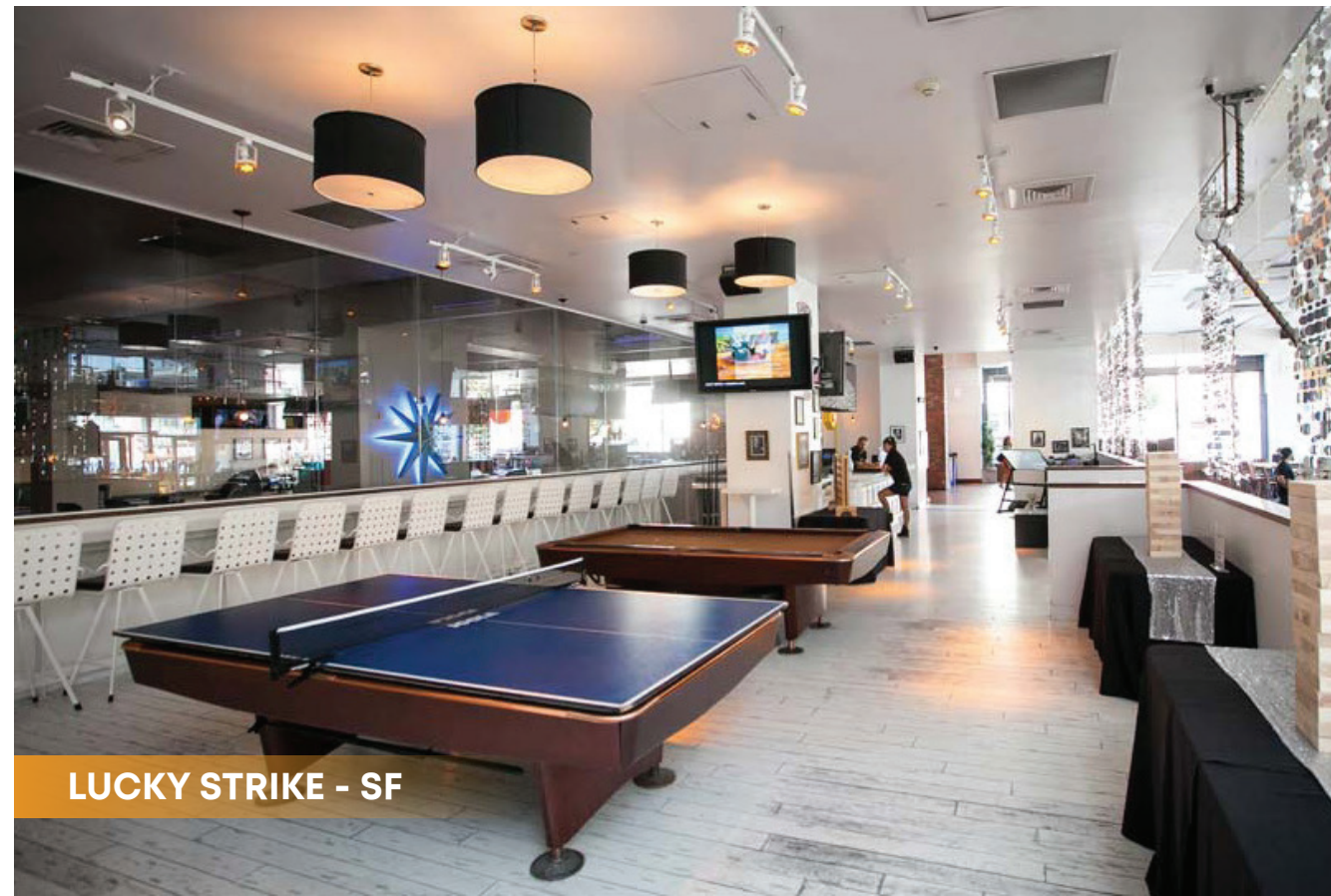
LUCKY STRIKE - SF