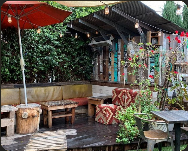
CAFECITO ORGANICO cafecitoorganico.com

In East Hollywood, Courage Bagels draws lines for its Montreal-style bagels served with heirloom tomato, smoked fish, and labneh. The tiny storefront's vintage signage and sidewalk seating reflect its simple, delicious ethos.