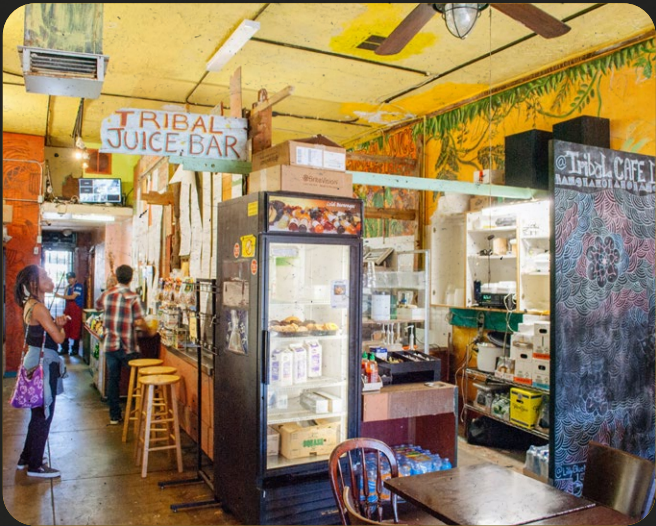
TRIBAL CAFE tribalcafe.com

Located on the edge of Silver Lake and Virgil Village, Sqirl is a breakfast and lunch hotspot known for its housemade jams, inventive toast creations, and cult-favorite sorrel pesto rice bowl. The space is casual but creative, always buzzing.