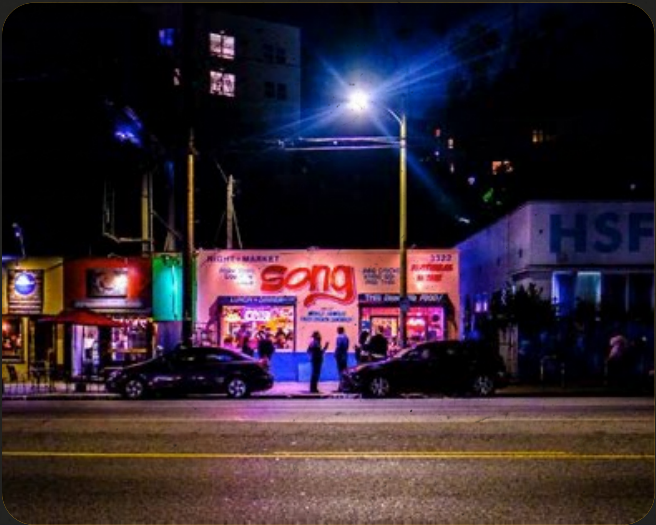
NIGHT + MARKET nightmarketsong.com

Tucked into Silver Lake, Cafecito Organico serves ethically sourced, small-batch coffee in a cozy garden patio setting. Known for its deep community roots and Latin American coffee partnerships, it's a neighborhood favorite for a quiet moment or meeting.