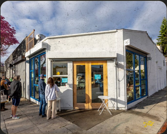
COURAGE BAGELS couragebagels.com

A longtime neighborhood staple, Tribal Cafe in Historic Filipinotown offers a colorful, graffiti-covered space serving organic juices, wellness shots, vegan plates, and hip-hop poetry nights. It blends counterculture charm with a plant-forward menu.