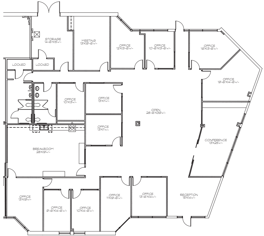
SUITE 200 6,490 SF