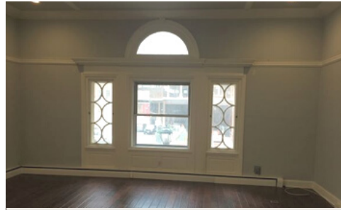
2ND FLOOR PRIVATE OFFICE