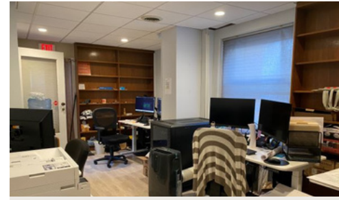
2ND FLOOR PLUG & PLAY OFFICE