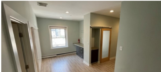
4TH FLOOR COMMON SPACE