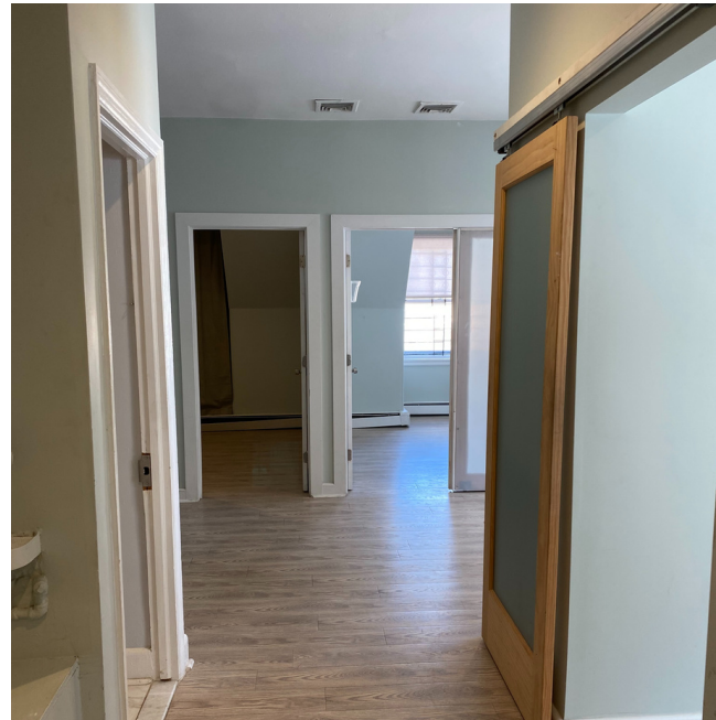
4TH FLOOR HALLWAY