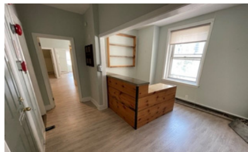
4TH FLOOR RECEPTION