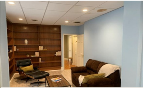
2ND FLOOR OFFICE