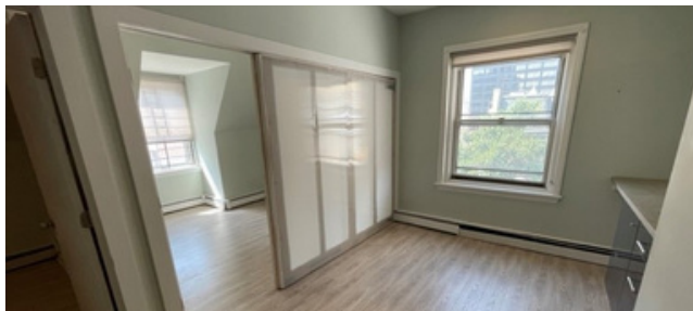
4TH FLOOR OFFICE