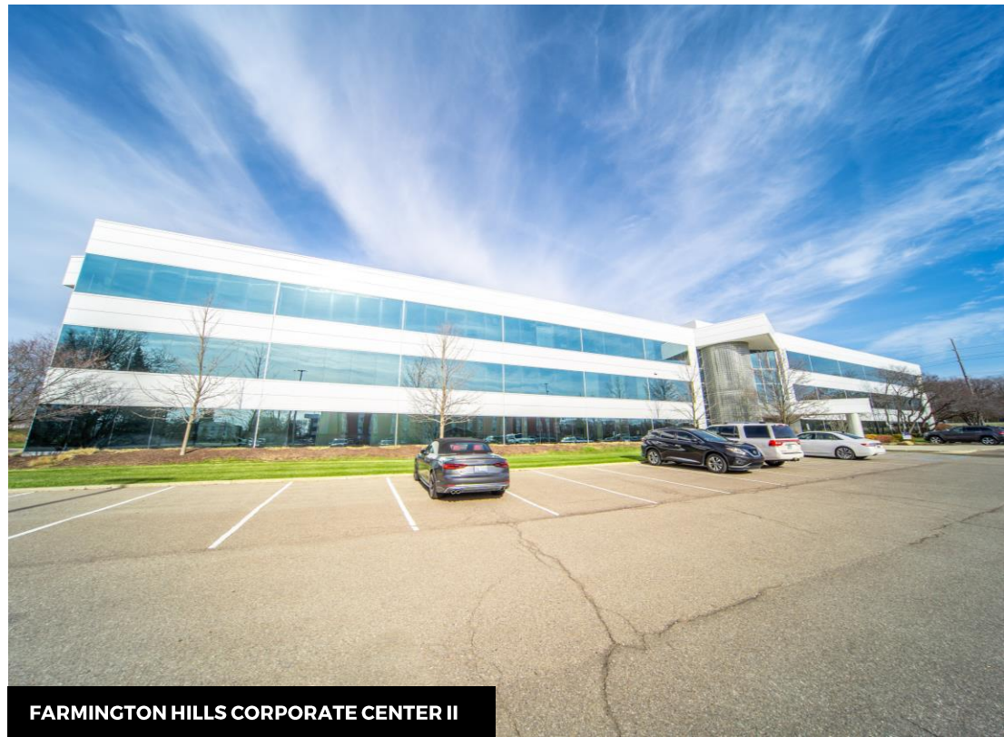
FARMINGTON HILLS CORPORATE CENTER II