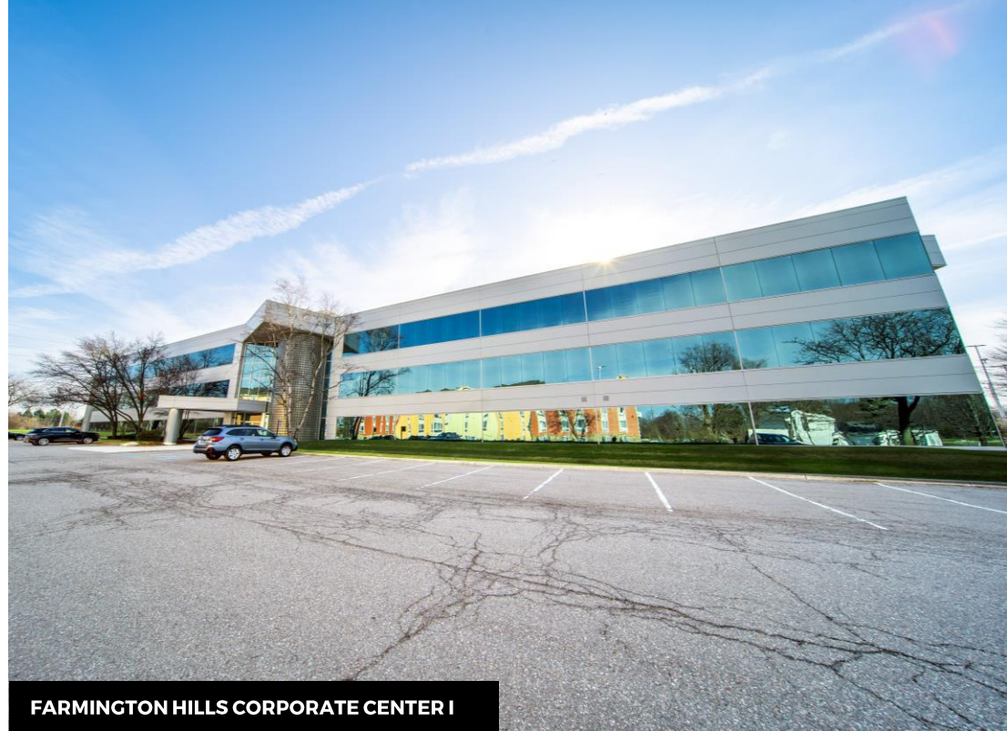
FARMINGTON HILLS CORPORATE CENTER I