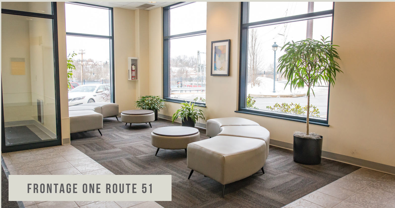
FRONTAGE ONE ROUTE 51