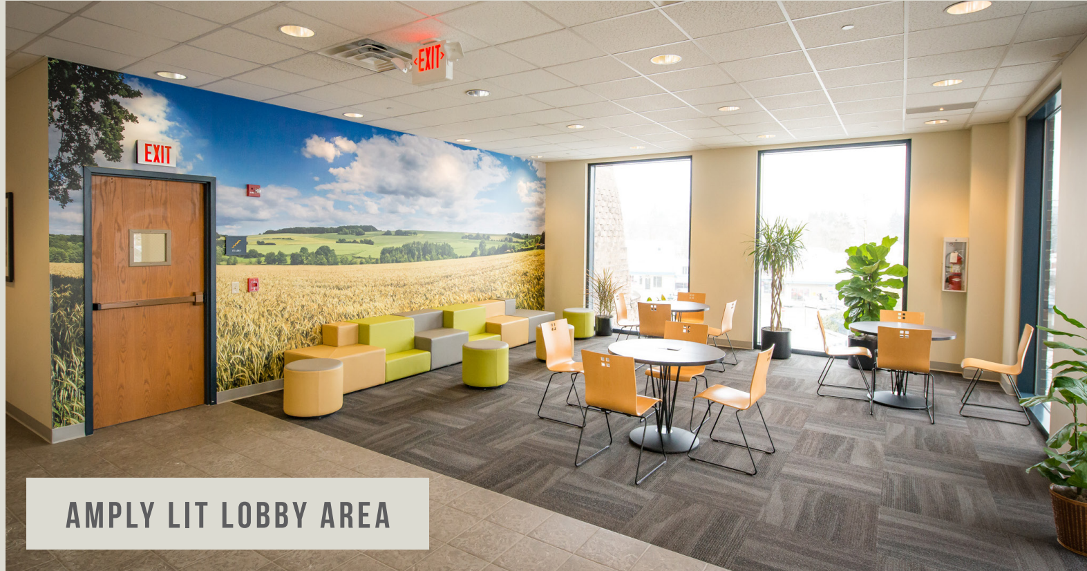
AMPLE LIT LOBBY AREA