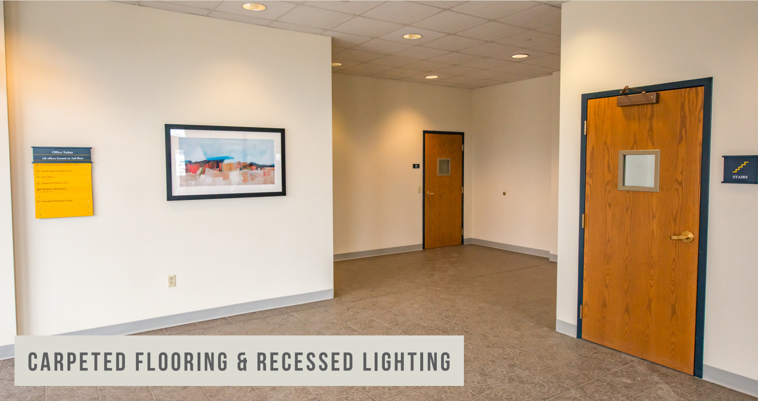
CARPETED FLOORING & RECESSED LIGHTING