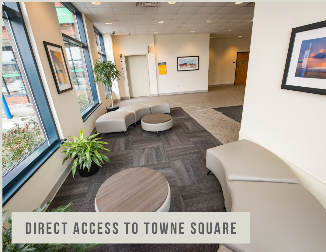
DIRECT ACCESS TO TOWNE SQUARE