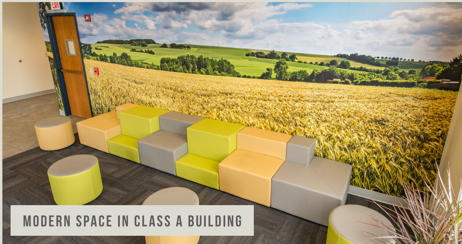
MODERN SPACE IN CLASS A BUILDING