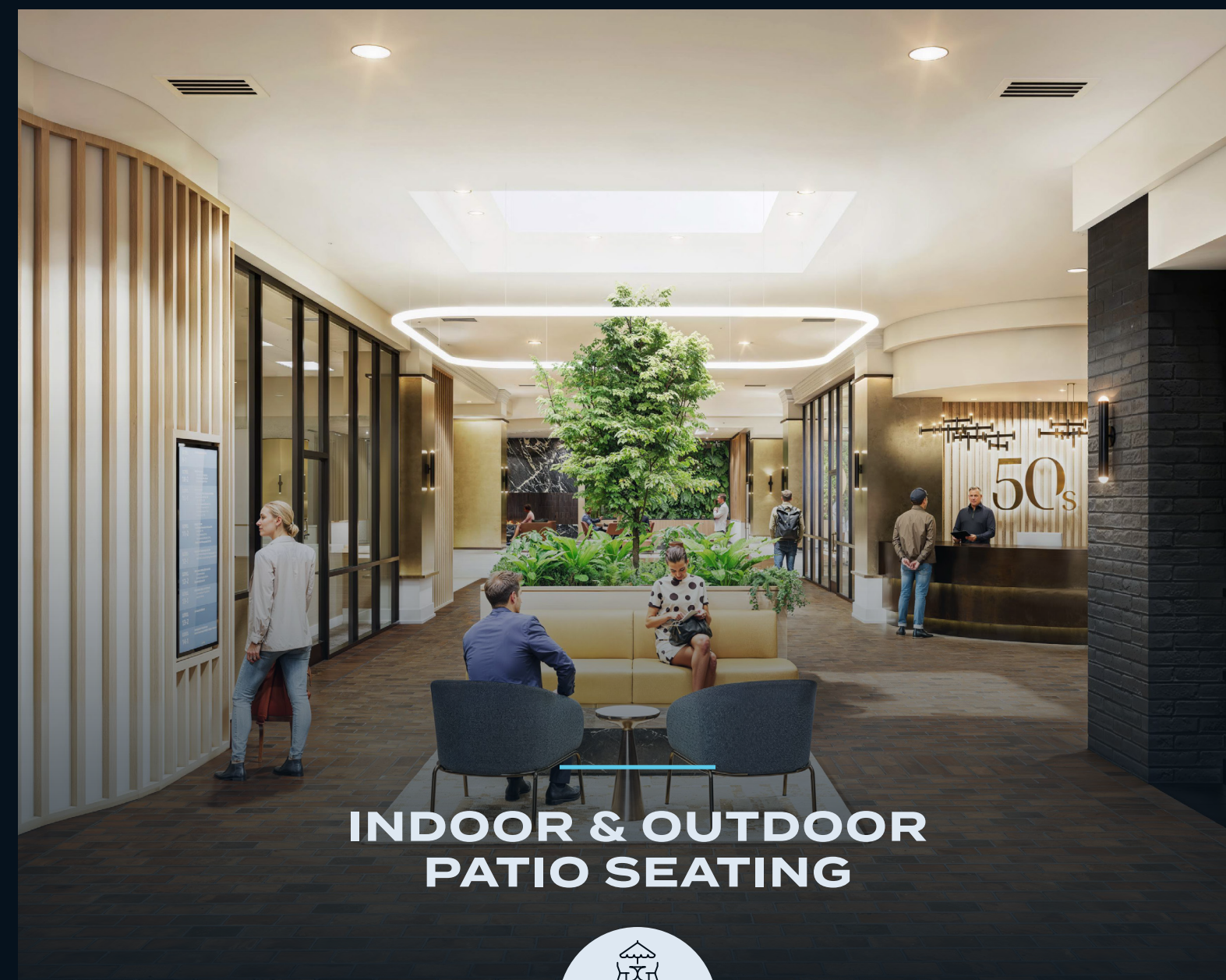
INDOOR & OUTDOOR PATIO SEATING