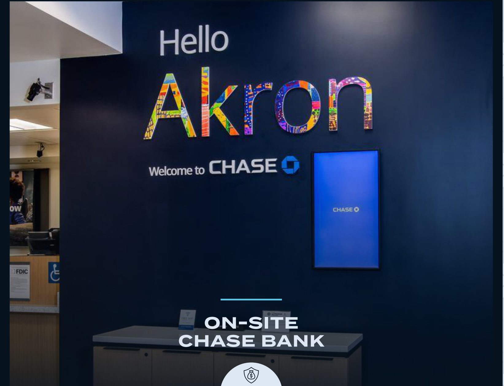
ON-SITE CHASE BANK