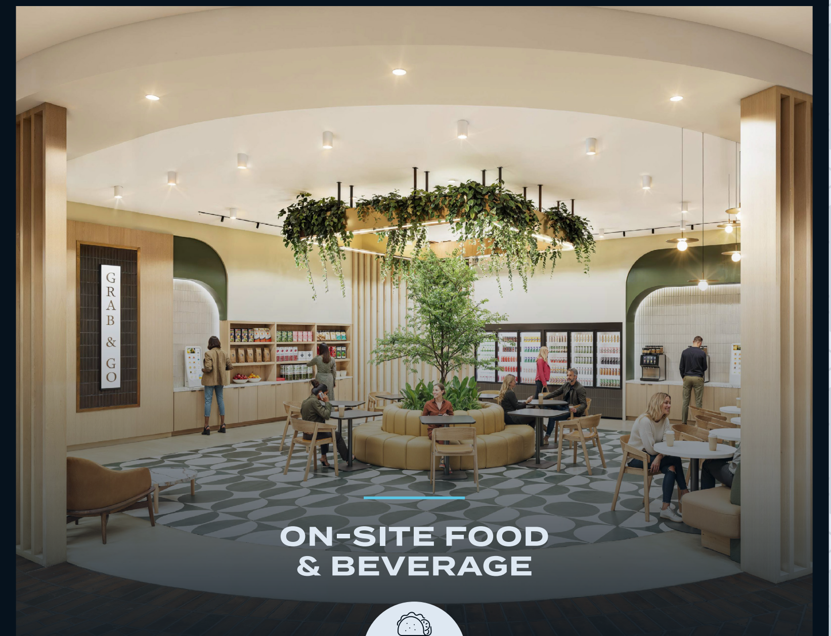
ON-SITE FOOD & BEVERAGE