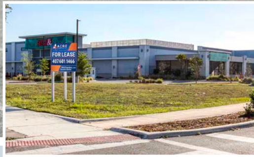
5,697 SF PAD 1