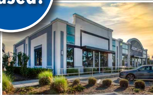
CAVA Coming Soon