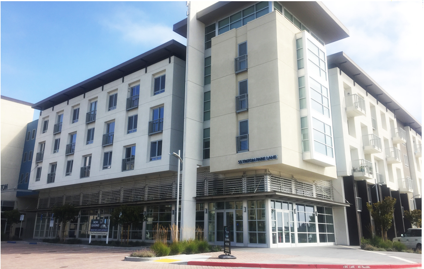
FIRE LANE - NO PARKING