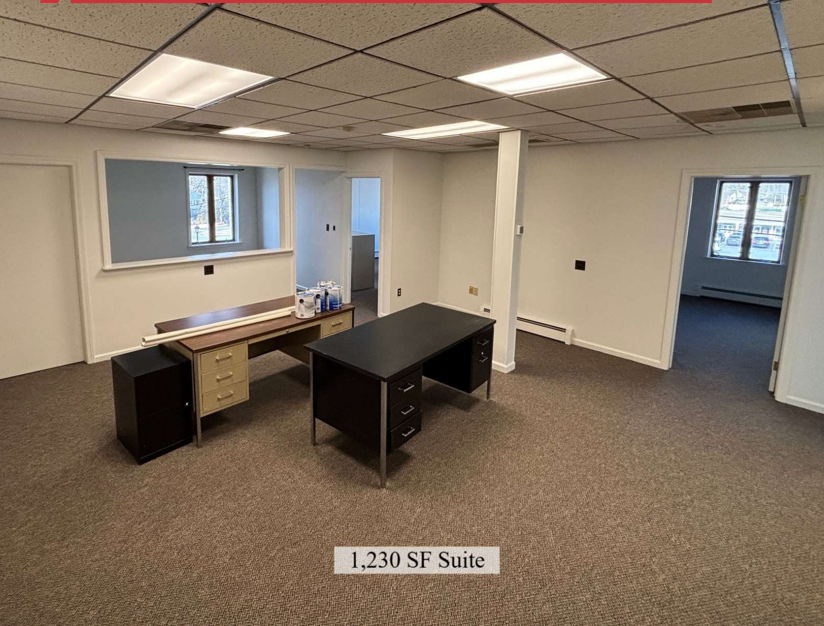
1,230 SF Suite

$25.00 SF Modified Gross | 266 - 1,230 SF