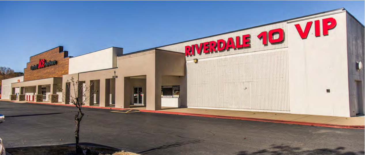
RIVERDALE SHOPPING CENTER