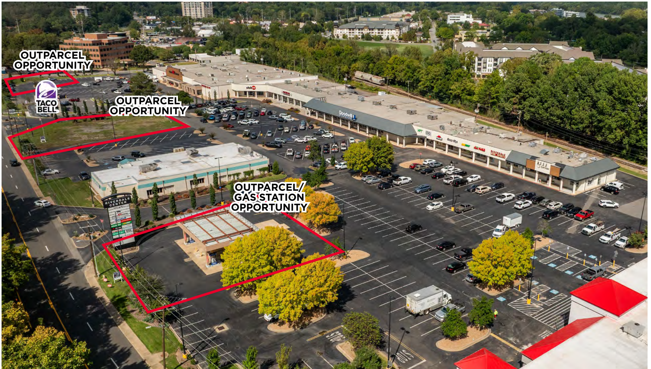
RIVERDALE SHOPPING CENTER