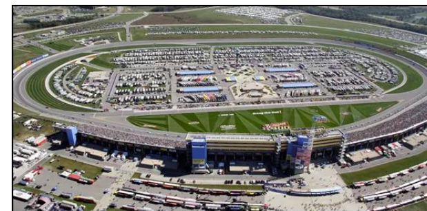
KANSAS SPEEDWAY AT VILLAGE WEST