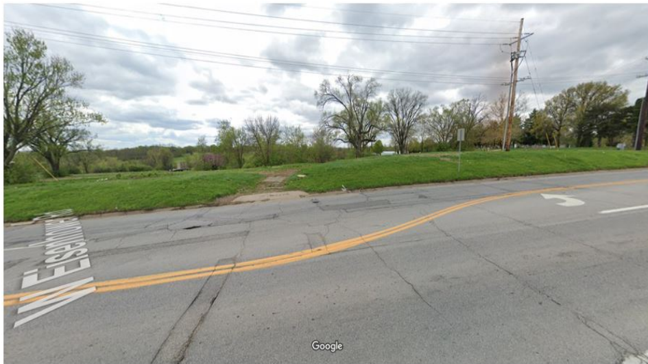
Land looking South from Leavenworth RD