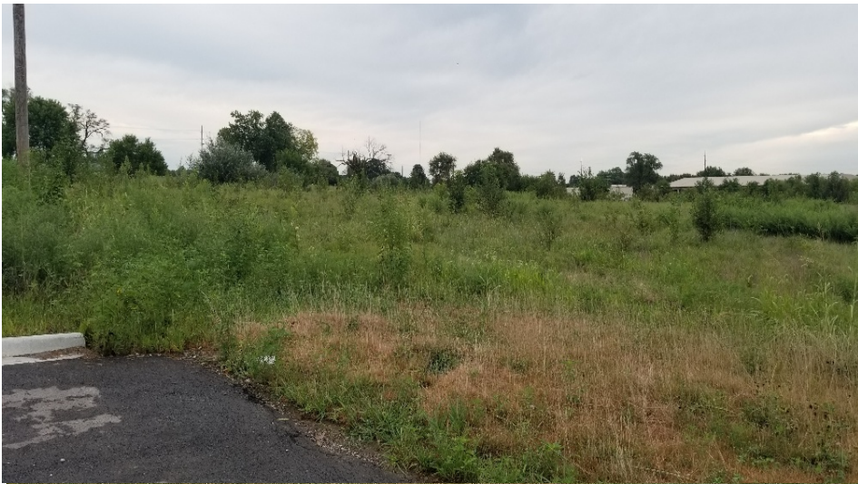
Land looking east from Desoto RD and future Progress DR