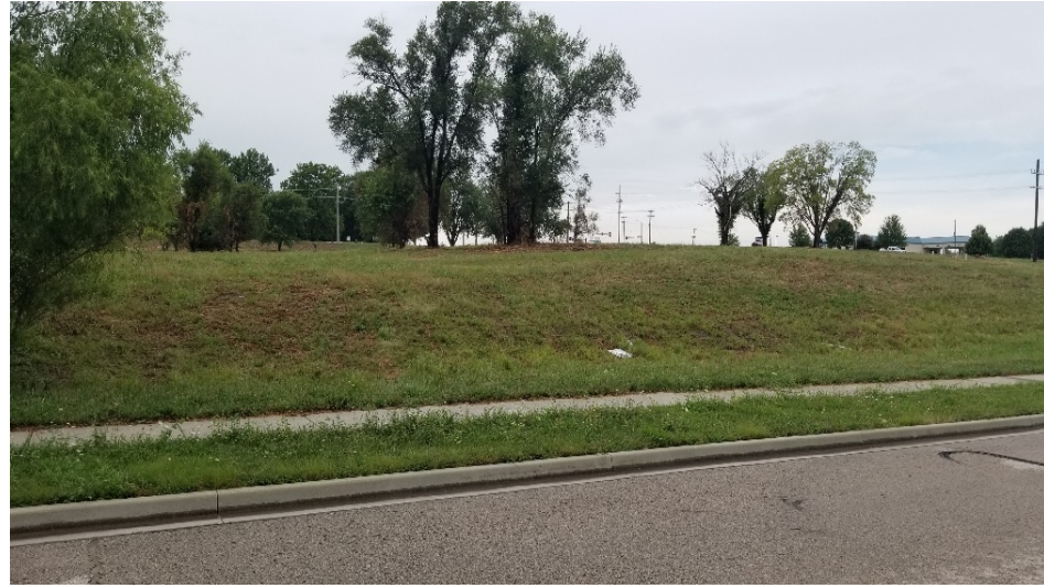
Land looking NW from cul-de-sac at end of Progress