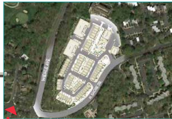
Tall Oaks Village Center 12040 North Shore Drive

Wiehle Avenue and North Shore Drive | Reston, VA 20190