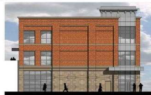
EAST ELEVATION SCALE: 1/8" = 1'-0"