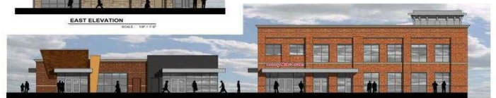
SOUTH ELEVATION SCALE: 1/8" = 1'-0"

✉ Michael Bergman +1 513 322 6309 mbergman@bergman-group.com