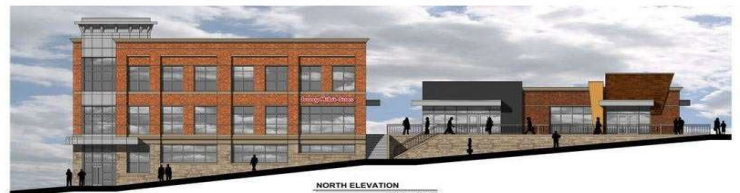
NORTH ELEVATION SCALE: 1/8" = 1'-0"