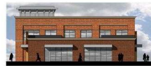
WEST ELEVATION SCALE: 1/8" = 1'-0"