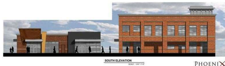
SOUTH ELEVATION SCALE: 1/8" = 1'-0"