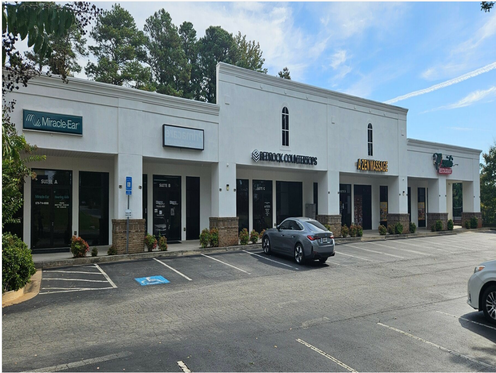
Front Building View 10/21/2025