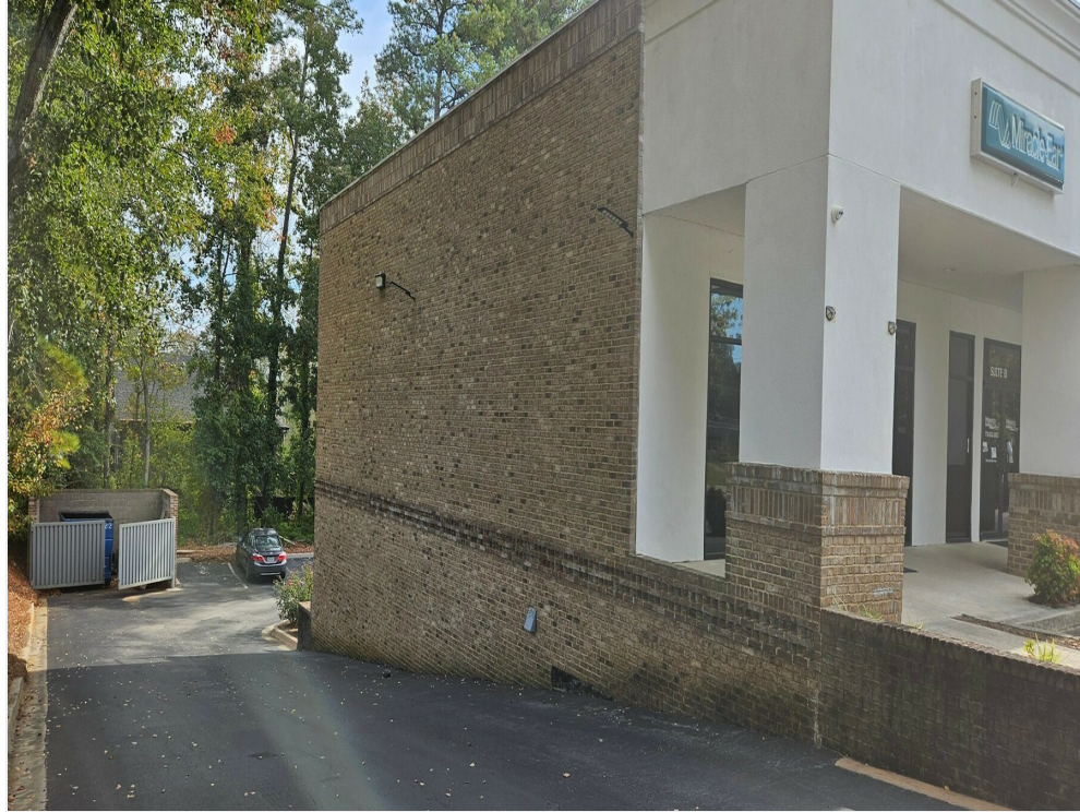
Left Side view Building 10/21/2025