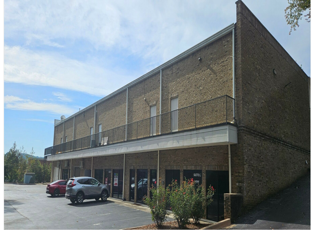
Backside View Building 10/21/2025