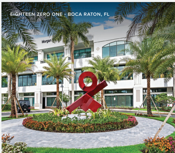
EIGHTEEN ZERO ONE - BOCA RATON, FL