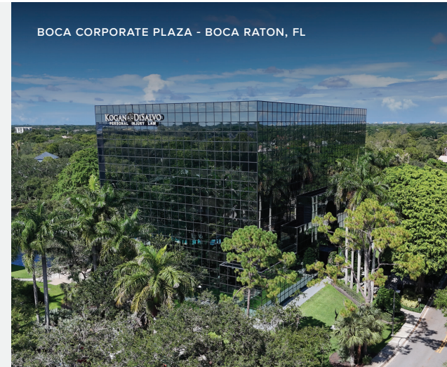
BOCA CORPORATE PLAZA - BOCA RATON, FL