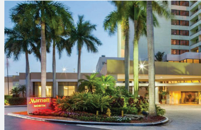
FORT LAUDERDALE MARRIOTT NORTH