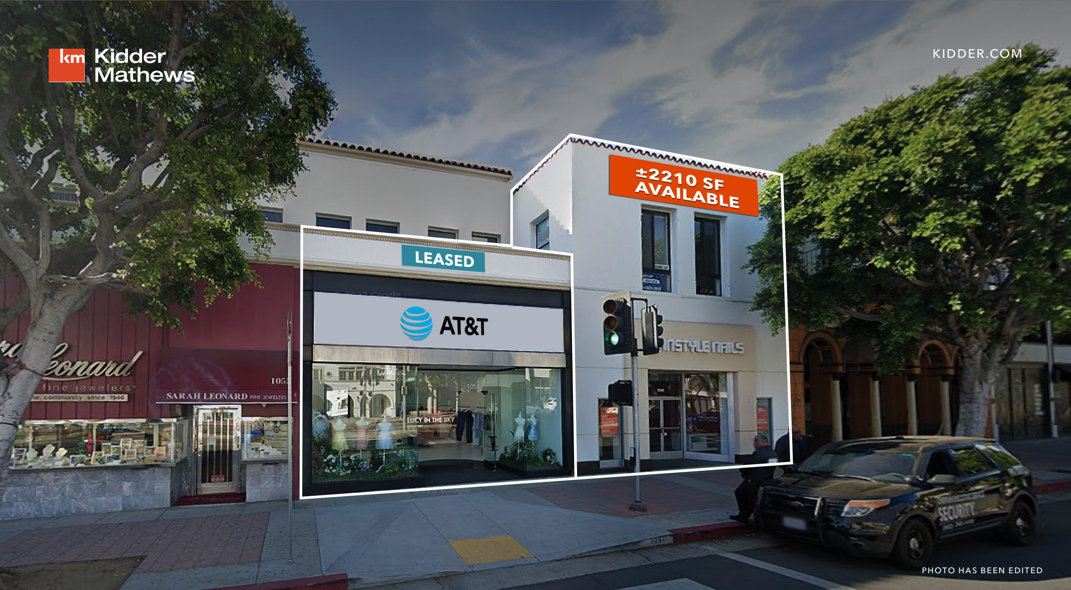
PHOTO HAS BEEN EDITED