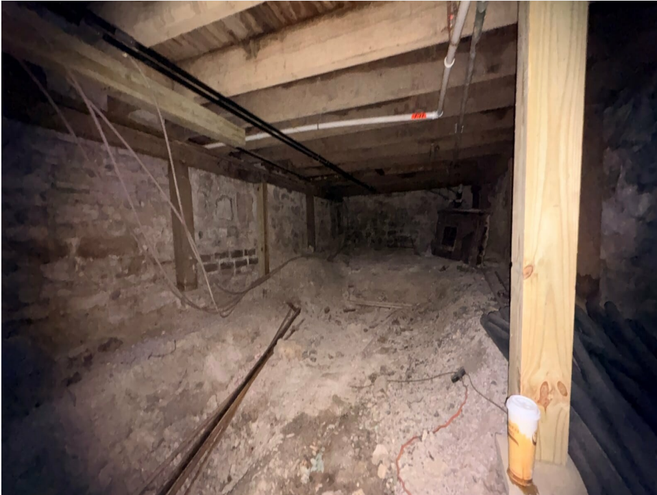
Unfinished Basement (Included)