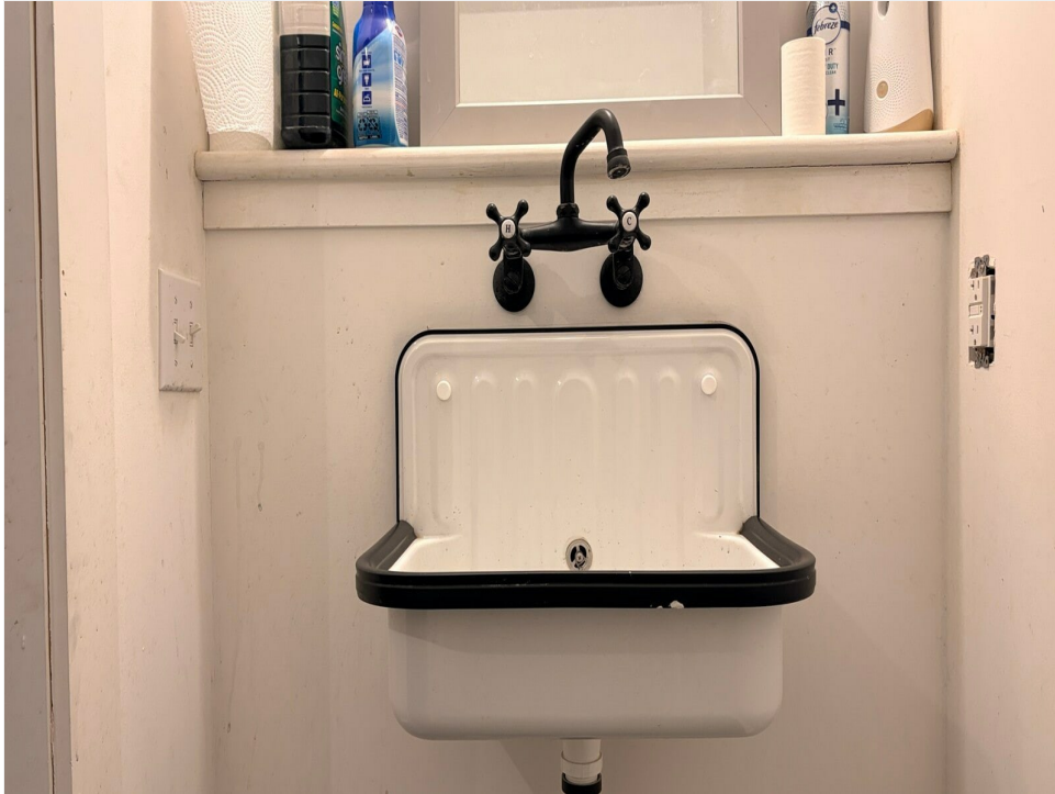
Sink in Private Half-Bath