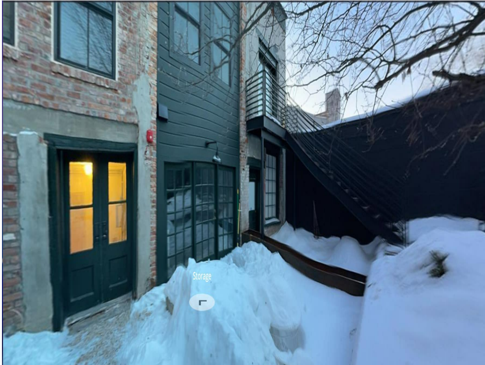
Rear Courtyard (Included)