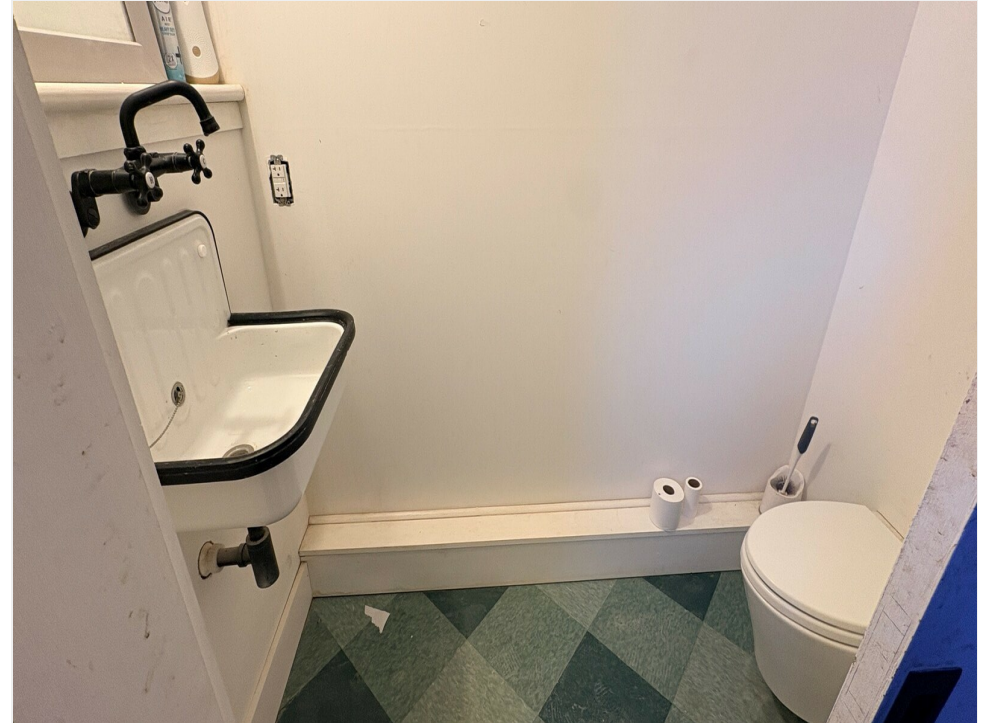
Private Half Bath