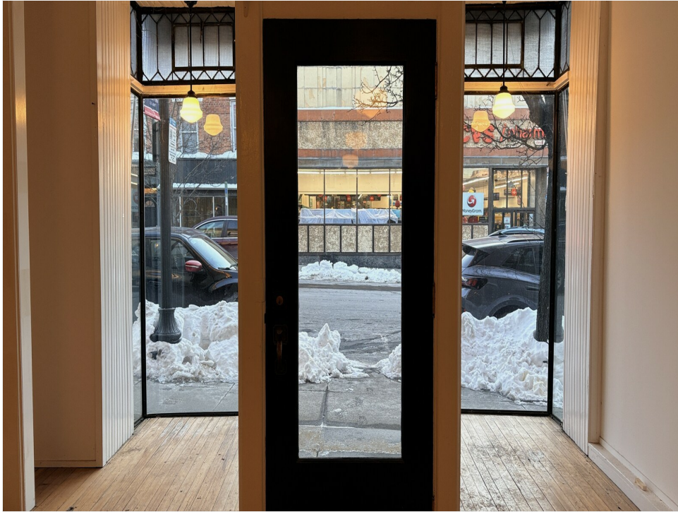
Front Entry and Windows looking toward Warren St