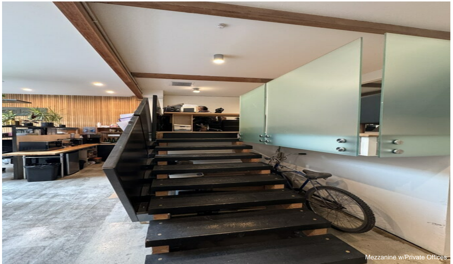
Mezzanine w/Private Offices