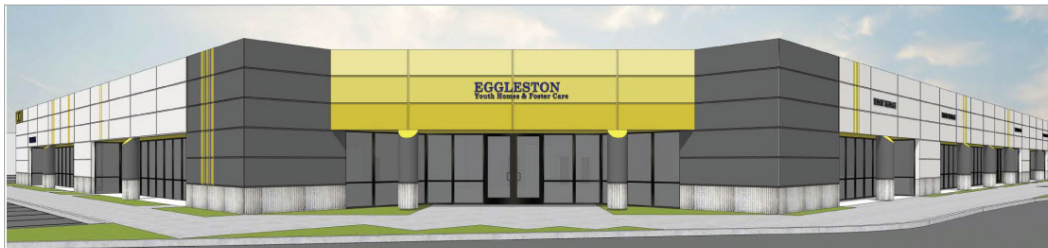
SOUTH EAST ANCHOR TENANT ENTRANCE