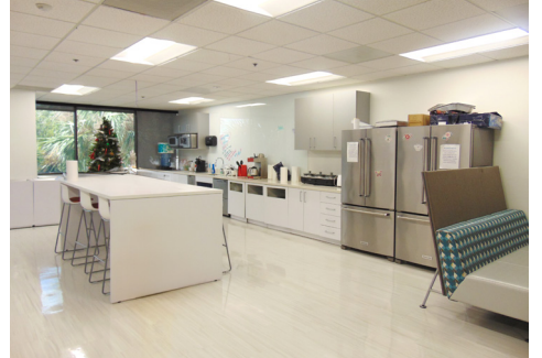
LARGE BREAK ROOM