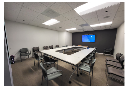
5 CONFERENCE ROOMS