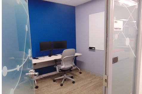
16 PRIVATE OFFICES