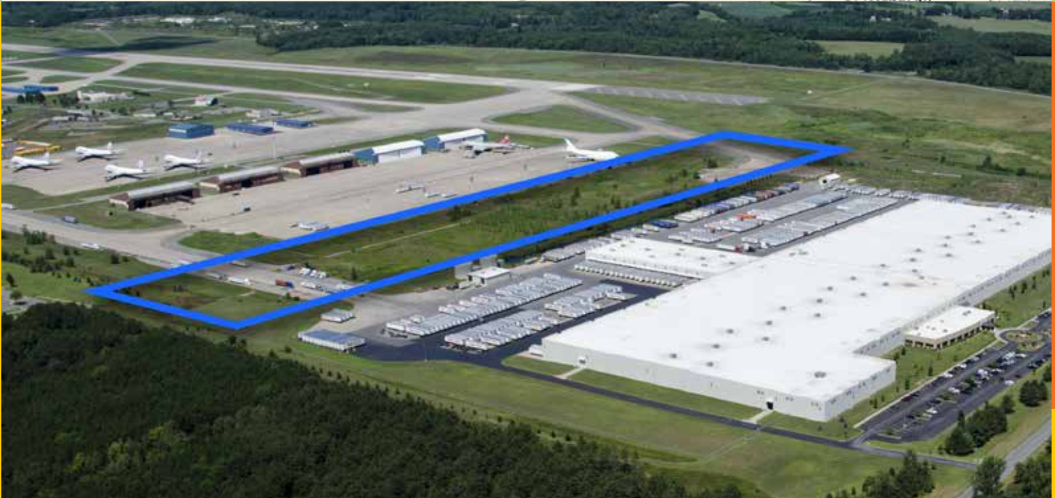
Enterprise Way viewing North over Family Dollar Distribution Center and Griffiss International Airport

Enterprise Way is an ideal location for aviation based uses, industrial uses and distribution facilities. Located between the Family Dollar Distribution Center and the Griffiss International Airport these easily divisible parcels are shovel ready and have access to necessary infrastructure including a rail line.