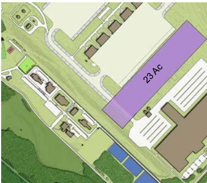
Griffiss Business and Technology Park Master Plan

Enterprise Way is an ideal location for aviation based uses, industrial uses and distribution facilities. Located between the Family Dollar Distribution Center and the Griffiss International Airport these easily divisible parcels are shovel ready and have access to necessary infrastructure including a rail line.