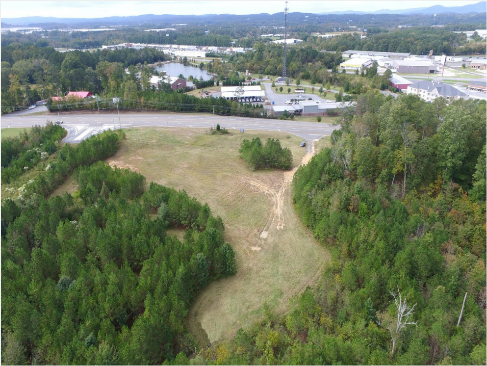
Level Land Aerial View