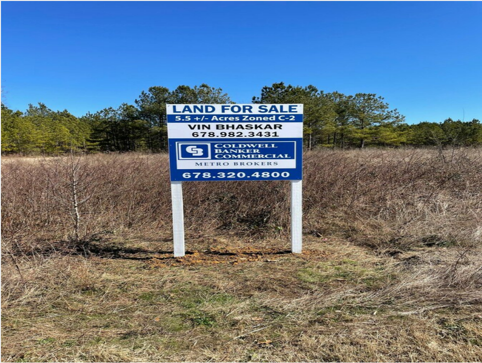
Property Sign on Fairmount Hwy