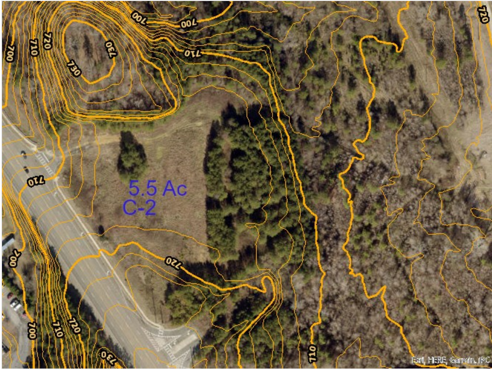
GIS Topo Map