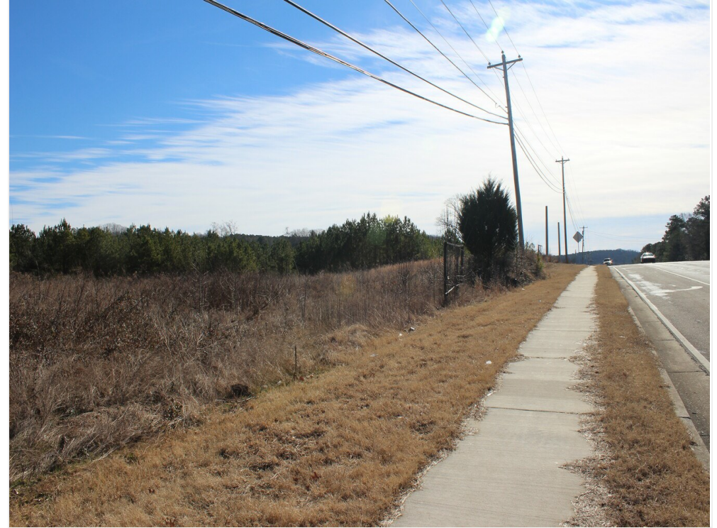
Wide Rd Frontage