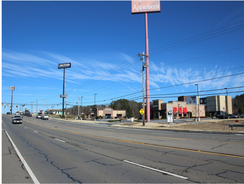
Heavily Travelled Rd