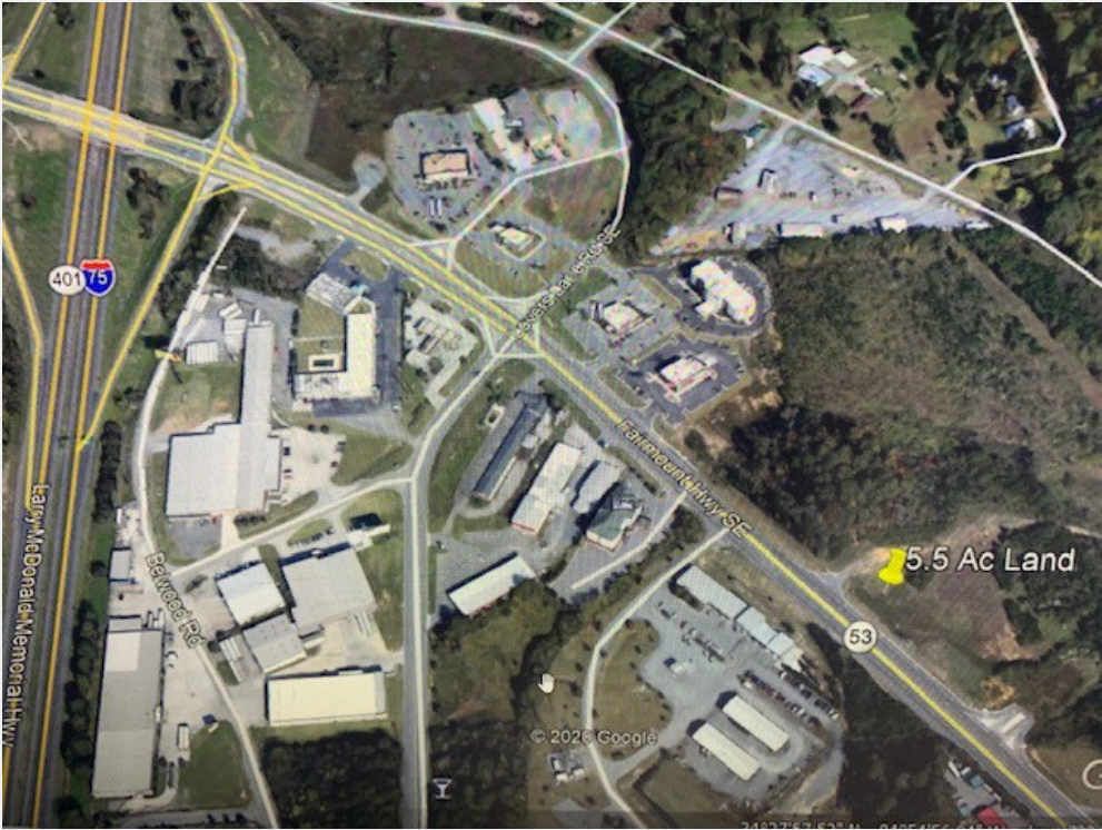
Fast Growing Area