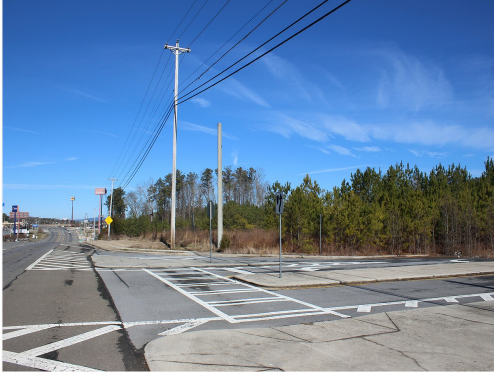
Curbs Cut and Turning Lane