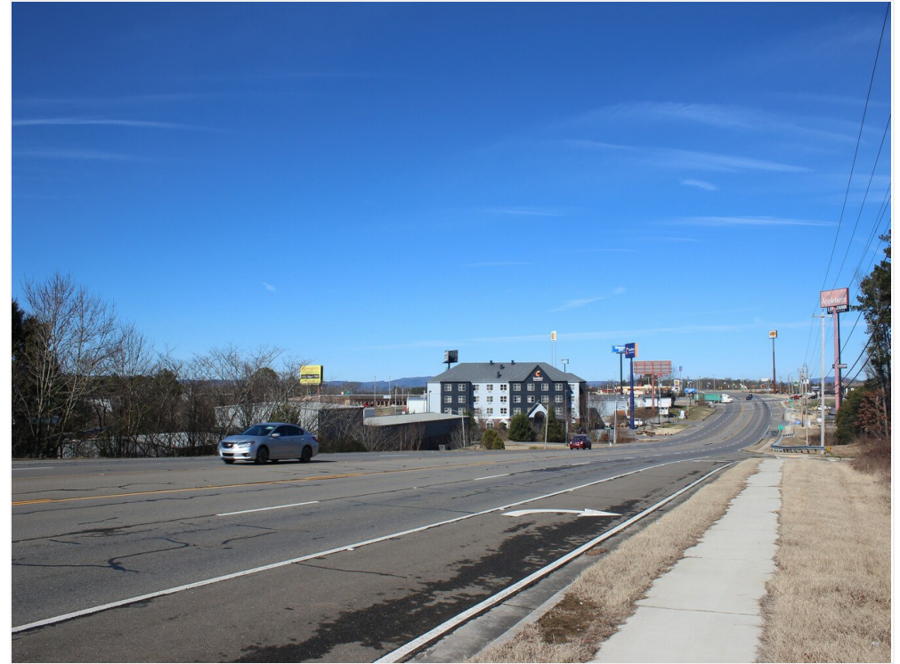
Major I-75 Interchange