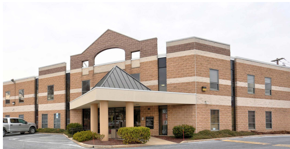
230 HARRISBURG AVE, UNIT 3, LANCASTER, PA 17603 ±4,600 SF unit 3 leased in a medical office building