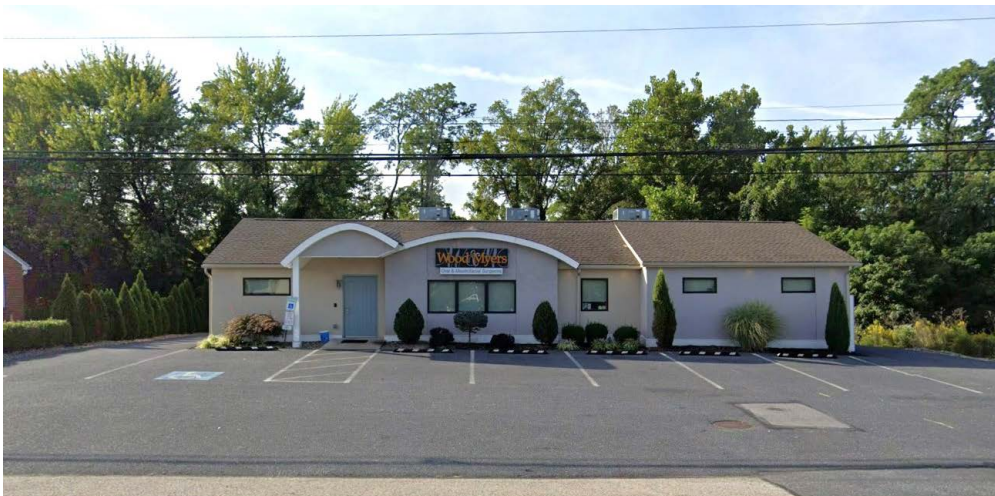
4341 LINGLESTOWN RD, HARRISBURG, PA 17112 ±1,855 SF medical office building

Wood & Myers Oral and Maxillofacial Surgery, P.C.