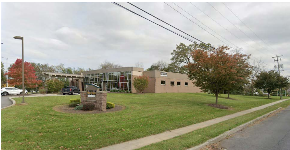
25 EASTGATE DR, CARLISLE, PA 17015 ±15,000 SF medical office building