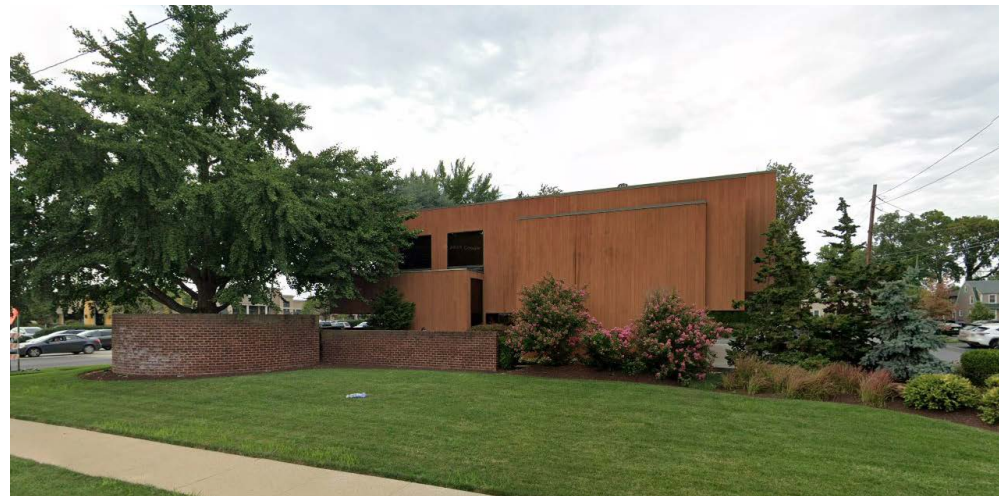
207 S 32ND ST @ 3121 YALE AVE, CAMP HILL, PA 17011 ±7,400 SF 2-story medical office building plus 14 parking spaces