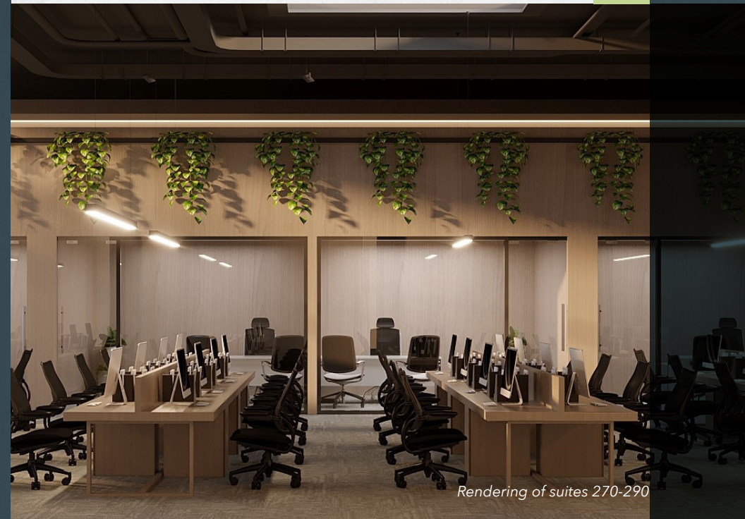
Rendering of suites 270-290

The project is situated in a core location along Goleta's tech corridor, with easy access to Hwy 101, UCSB, and Santa Barbara Airport.