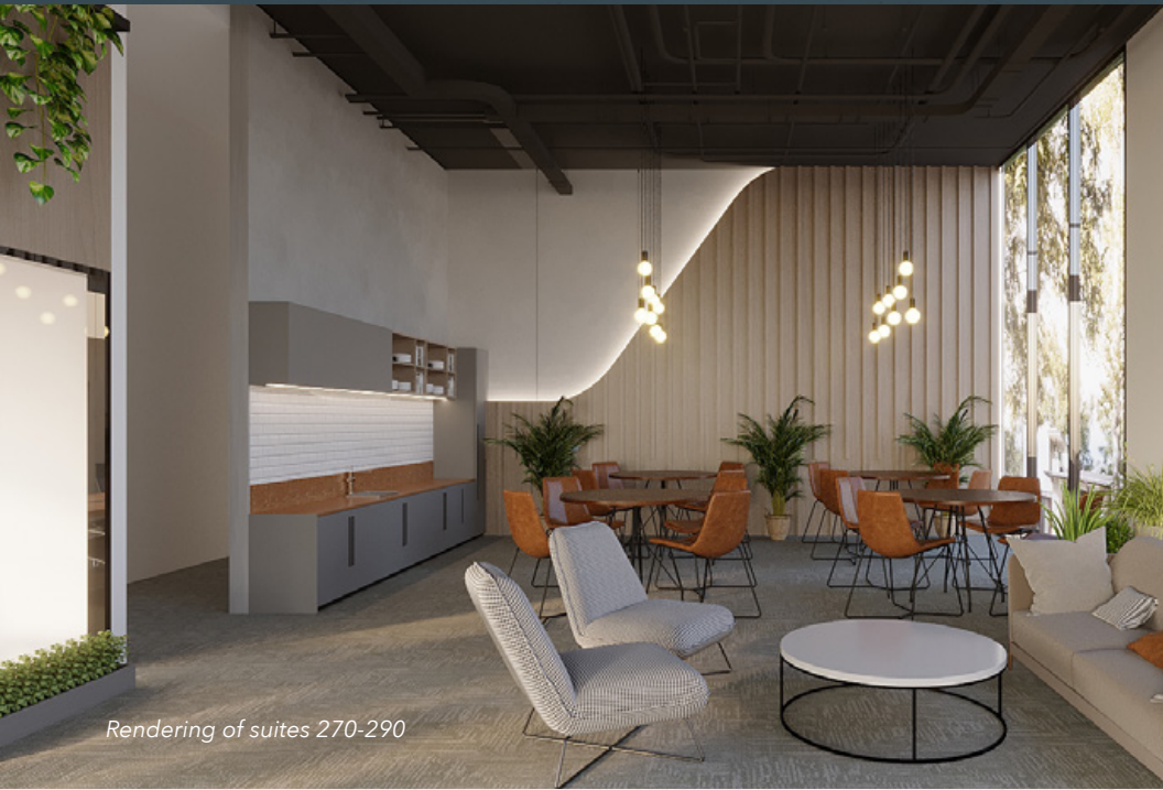
Rendering of suites 270-290