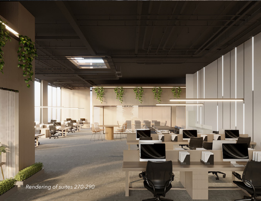
Rendering of suites 270-290