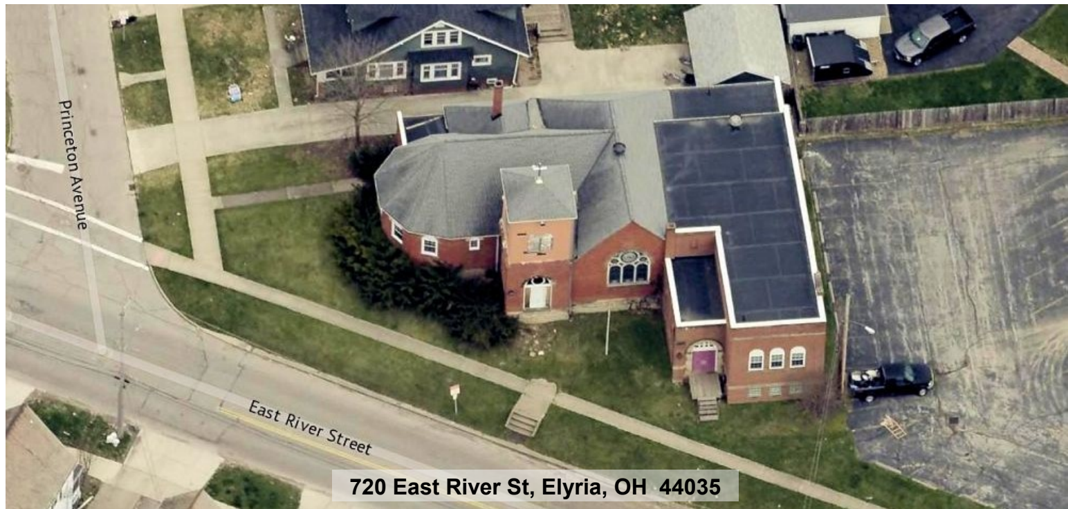
720 East River St, Elyria, OH 44035